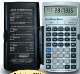
Protective 360° Hard Cover Door