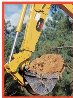
MP2 mounted to a backhoe boom