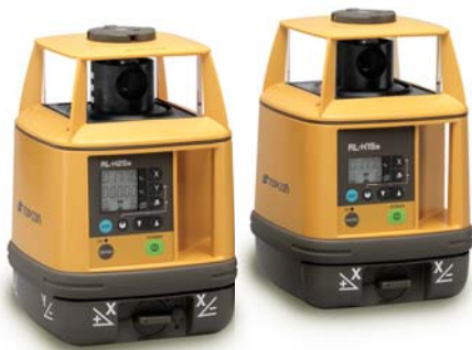
RL-H1Sa/RL-H2Sa High Accuracy Slope Lasers

Seeing is believing, so if you haven't had the chance to see a live demonstration of the RL-H1Sa and RL-H2Sa, contact your nearest Topcon Authorized Dealer. In no time you'll know, it's time.