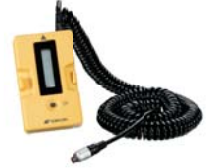
56102 RD-10 Remote Display for LS-70A