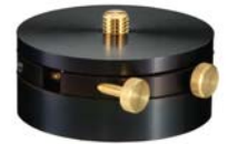
56123 Rotating Laser Tangent Base