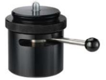
56045 Quick Release w/Adapter Set