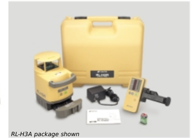
RL-H3A package shown