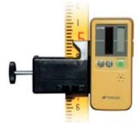
P/N: 57108 LS-70BG

LS-70BG Laser Sensor Perfect when you're using your RL-VH4G to set footers or check grade, the LS-70BG features an audible indicator. 11 levels of on-grade precision, laser power indicator, and HI alert displayed on a high contrast LCD.