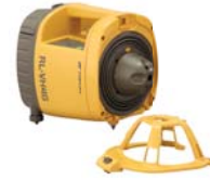
Removable Laser Guard

Rugged, sealed design protects the unit from dust and moisture