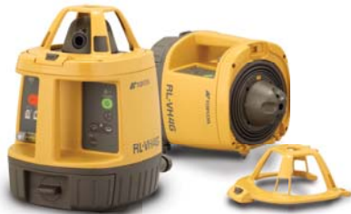
RL-VH4G "Smart" Interior Laser

Topcon's RL-VH4G interior laser: It's time for the one interior laser that's right for all jobs.