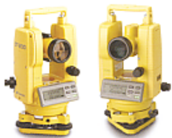
DT-200/DT-200L Series Digital Theodolite